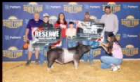
2024 NMSF NM BRED RES GRAND CHAMPION