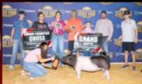
2024 NMSF NM BRED GRAND CHAMPION