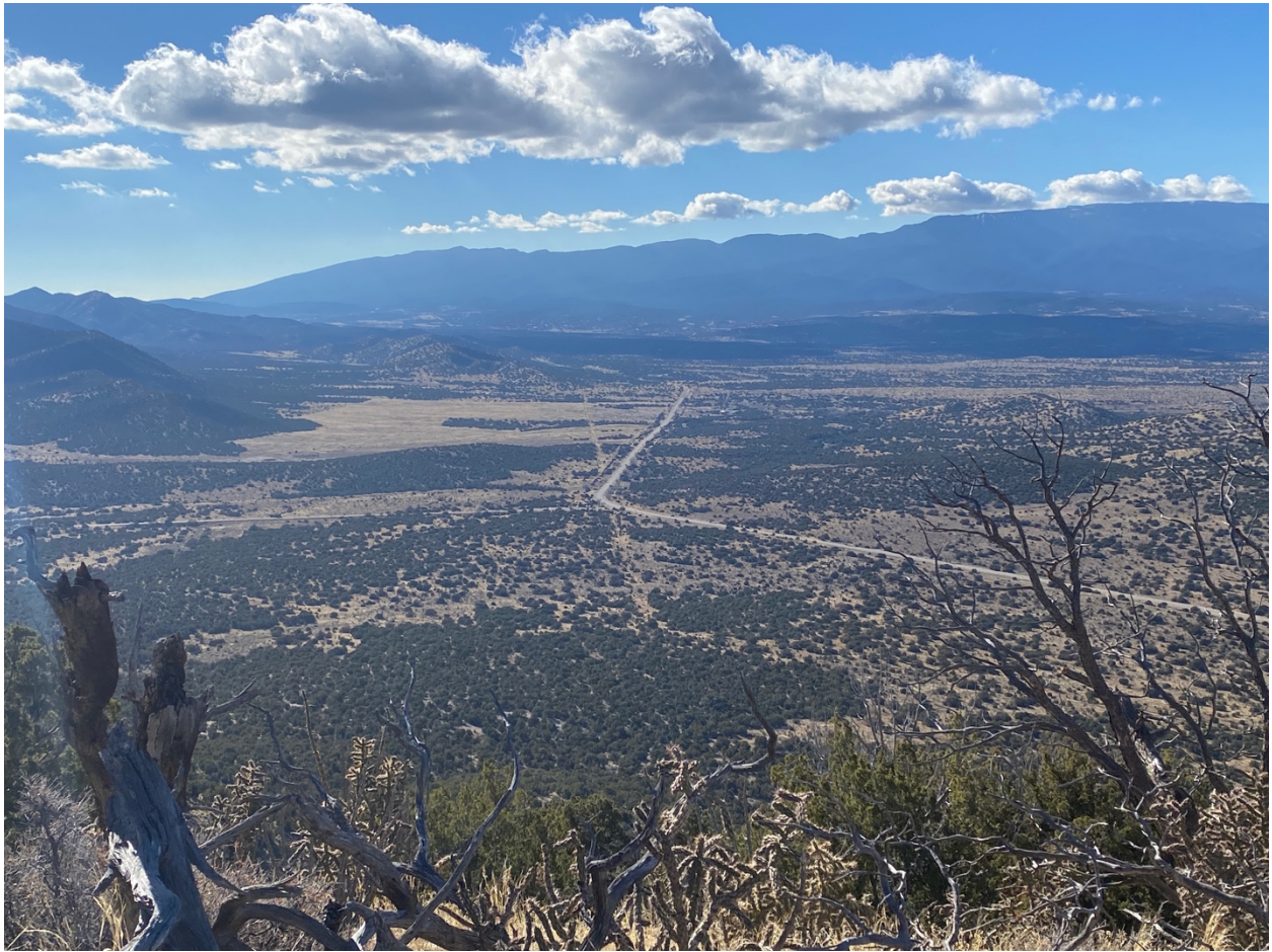
View of the Turquoise Trail National Scenic Byway from the top of the San Pedro Mountains